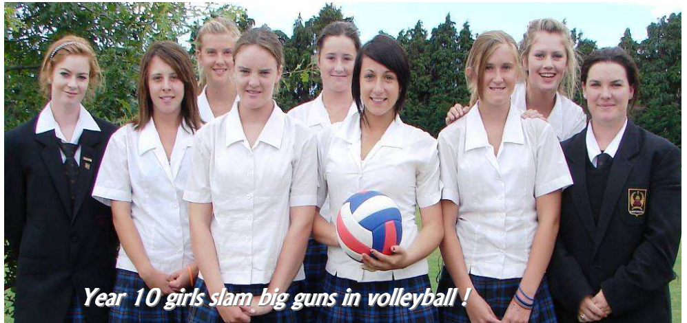
Year 10 girls slam big guns in volleyball !

The boys had a very tight game against the Allandale team. The game swung one way then another for all 3 sets. We established a handy lead in the first set, and looked like winning comfortably, but allowed Allandale back into the set. Garin ended up clinging on for a 25-23 win in the first set. There was never much in the second set the whole time, and Allandale ended up with a 25-23 set win. The final set was to 15 and the Garin Seniors held their nerve and took out the set 15-13, and a narrow match victory. It's the teams second win in two competition games, and they have played intelligent volleyball both times. This week saw a marked improvement in serving, with very few points lost directly from the serve. An excellent effort.