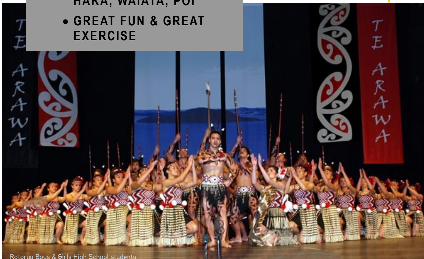
Rotorua Boys & Girls High School students

SIGN UP FORMS AT THE OFFICE OR SEE MRS A FOR DETAILS