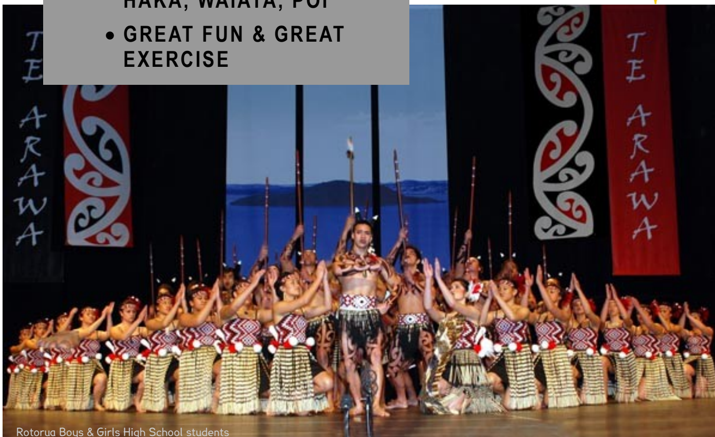
Rotorua Boys & Girls High School students

SIGN UP FORMS AT THE OFFICE OR SEE MRS A FOR DETAILS