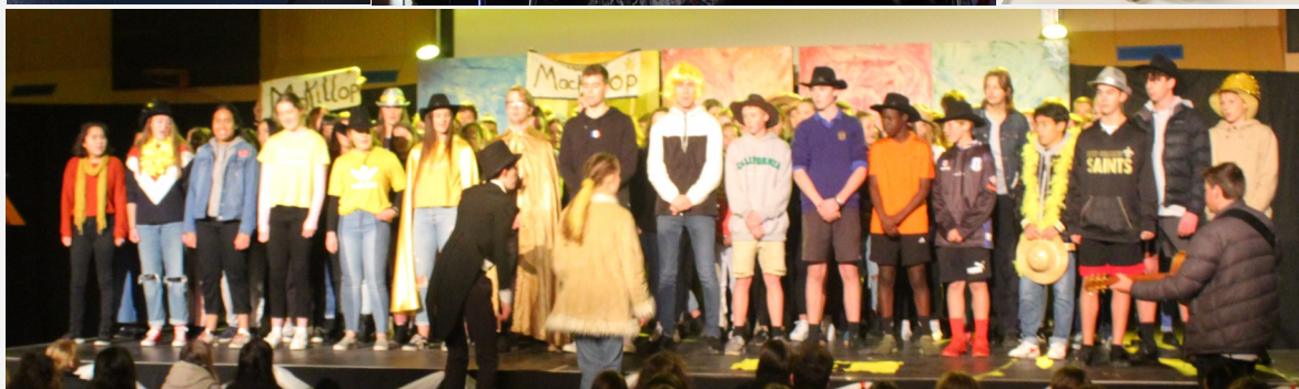
Take a Moment: